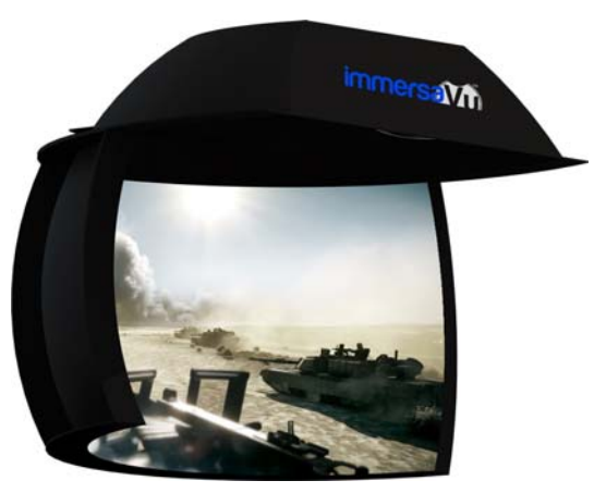
Figure 2. Immersive Displays' ImmersaVu

The immersive environment is formed by Immersive Display's ImmersaVu<sup>4</sup>, a composite moulded 160^{\circ} panoramic dome screen, which allows a free-range of head movement. Due to the size of the ImmersaVu (2 mts. length) we will need a suitable space for the device. Along with this we will need access to electric power for the following components: a) the ImmersaVu (1 projector & 1 server), b) 2 PCs, c) the BuzzBoard Desktop robot (1 Raspberry Pi) and d) a network switch. Internet access is not essential but it might be needed for showing videos of other demos.