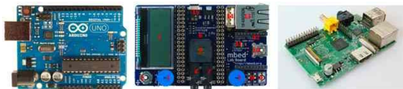
Fig. 1. (left to right): Arduino, mbed and Raspberry PI.

The Arduino, mbed RPi devices are shown in figure 1. A cursory glance reveals they are very different to regular personal computers and, as one might expect from such a bare technological appearance, the architectural functionalities are more obvious and the workings more basic, all of which are used as an educational advantage.