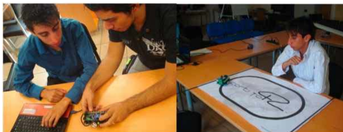
Figure 3. Students programming and testing the Buzz-Bot.

feedback, and USB and external DC charging. This example uses a mbed which can be programmed using C/C++. Programming the Buzz-Bot is very simple, using the online tools and software available on the mbed site. The program is compiled online, generating a .BIN file. The Buzzbed is connected to a PC via a USB (which behaves like a USB pen drive) allowing the user to ‘drag and drop’ the compiled program onto the “pen drive”. Figure 3 shows students from the Instituto Tecnológico de Leon (Mexico) programming and testing the Buzz-Bot as a line follower.