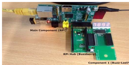
Figure 5 - Buzz-Free (Wireless IO) Figure 6 – RPi + BuzzBoards (IoT Application)

For example, if an I 2 C temperature sensor was connected to the Buzz-Free module, a smart phone could issue a simple ASCII command requesting data from the sensors I 2 C address. Whilst the Buzz-Free module does have a processor, the protocol and firmware are fixed and the Buzz-Free module can be thought of as an IO breakout for the embedded processor, be it in a smart phone, Raspberry Pi or some other computer.