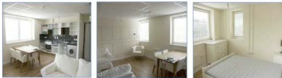
Figure 3. iForest TestBed.

The iForest then offers recommendations to real iSpace inhabitants, for particular scenario based on an aggregation of real and survey data. By way of an example to illustrate its operation, when the inhabitant going to sleep, it will try to find a best preference match for him/her, using a personalised similarity match. Therefore the iSpace might offer rules to switch the lights off, on, or adjust their brightness level in the dormitory, based on other inhabitants or students similarity level (and preferences).