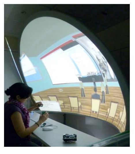
Figure 3b. The Immersive Learning Desk