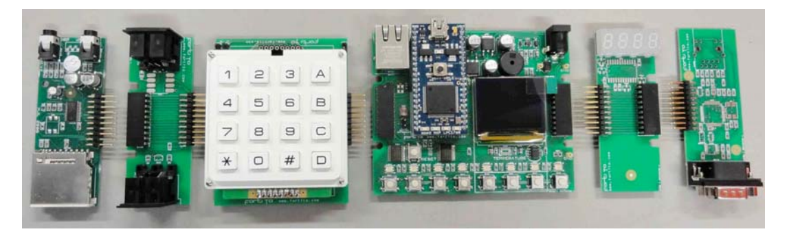
Figure 1. Buzz-Board Examples - From Left to Right Audio, Midi, KeyPad, Base (Processor), LED & Network

The buzz-board toolkit is an open-system comprising some 30 pluggable hardware boards that can be interconnected together to make a variety of " Internet-of-Things " applications (see www.fortito.com). To understand the Buzz-Board concept, it is easiest to look at some pictures; figure 1 illustrates a few of these modules.