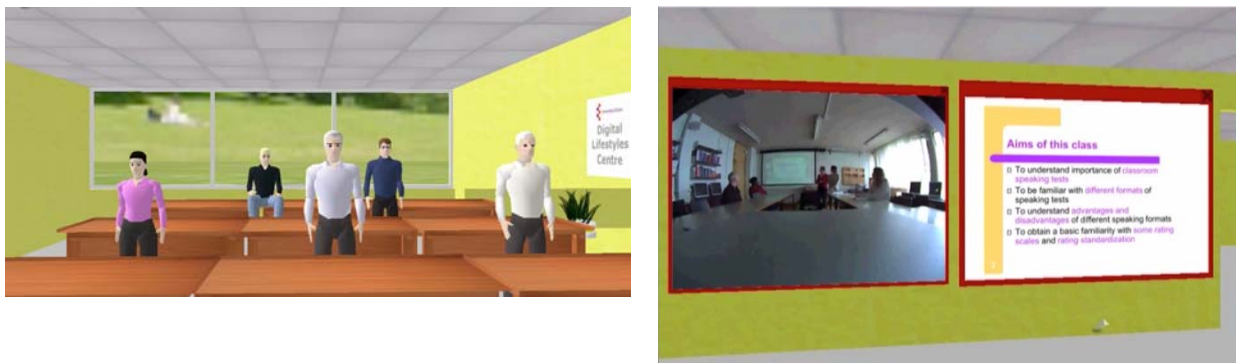
Figure 2. MiRTLE. Lecturer's view of remotely located students and Student's view of lecture

From the initial evaluations of MiRTLE at the University of Essex, a number of valuable issues were highlighted that have implications for future uses of this technology. It particularly highlighted potential social issues, such as the impact on student motivation and perceptions of crowding and jostling for position in the virtual classroom. The trial showed that there was potential for naturalistic and spontaneous social interaction between virtual and physically present students, which may increase a sense of presence for all involved. Teachers also recognized the potential value of this approach, and that, once students are logged on and settled, the MiRTLE environment had a minimal impact on normal learning patterns. A key finding was that spontaneous social interaction between virtual and physically present students was possible. It implies that MiRTLE facilitated a breaking down of the barriers between the virtual and the physical, allowing impromptu and naturalistic exchanges that are likely to increase a sense of presence for all involved.