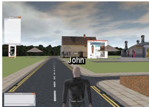
Figure 5. SIMiLLE virtual Village

Figures 4 and 5 illustrate screens from SIMiLLE with an avatar firstly standing in the virtual University of Essex campus and then in the Village.