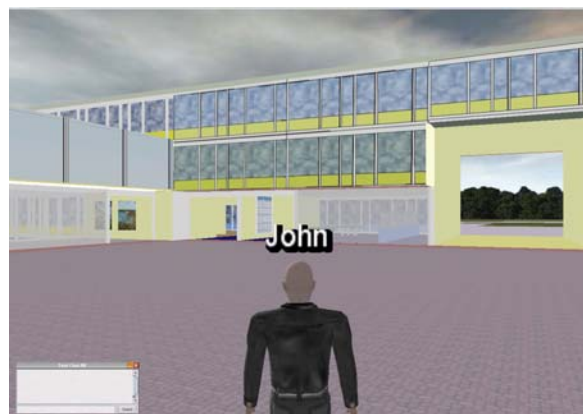
Figure 4. SIMiLLE virtual University of Essex campus

One of the strengths of the Wonderland platform is the ability to drag content (documents) from the PC desktop into a Wonderland world. These documents are then presented as objects within the 3D world. Any Collada compliant object can be imported and viewed within the world. This feature supported one of the scenarios identified in the requirements, which was the ability for teachers to customise the virtual world with new objects. A useful repository for publicly available Collada content is the Google Sketchup 3D warehouse 13 , which contains thousands of freely available content objects.