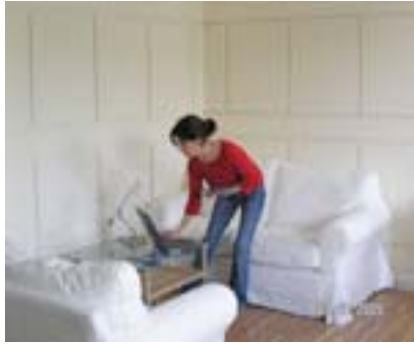
Figure 1. Creating MAPs via physical interaction in the Essex iSpace

consequents. The actions of one rule are only executed if the conditions of the rule are satisfied.