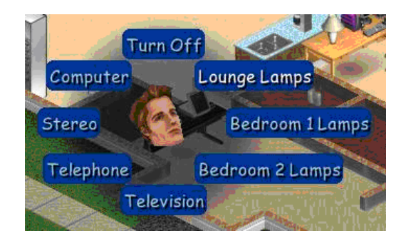
Fig. 4: Sims Object Remote Control Menu

Agent code, added to specially created classes, ran from the voting machine thread, prompting state changes to objects in the environment as required. Agents determined when to make changes using sensor settings coming into the voting machine thread on each cycle.