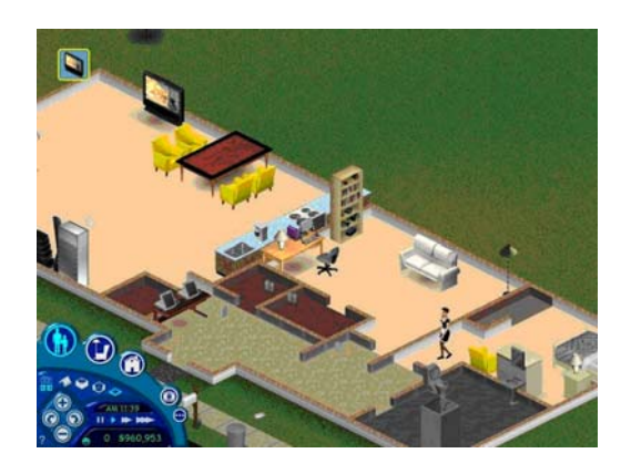
Fig. 3: The Sims iSpace Simulator

for other devices and any required information contained within. For this stage of the project the most efficient way to achieve this was to program a single Sims object to act as a 'remote-control' for other pervasive devices in the environment. The 'Dumbold Voting Machine' [12] an add-on device available online, was modified to act as a remote-interface, usable by Sims avatars in the environment. Within the code, for the re-programmed voting machine, the current state of each pervasive device in the environment was stored to memory.