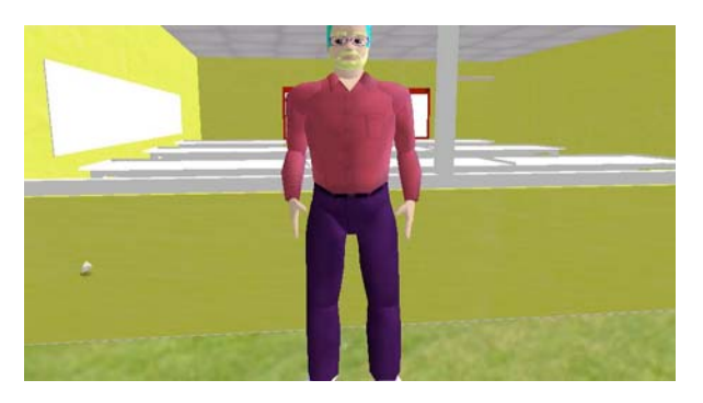
Fig. 6: The MiRTLE Seminar/Lecture Room

Virtual avatars are to be added to represent lecturers and remote students using the environment. Key avatars will have relevant speech and audio files attached through the Wonderland voice-bridge system.