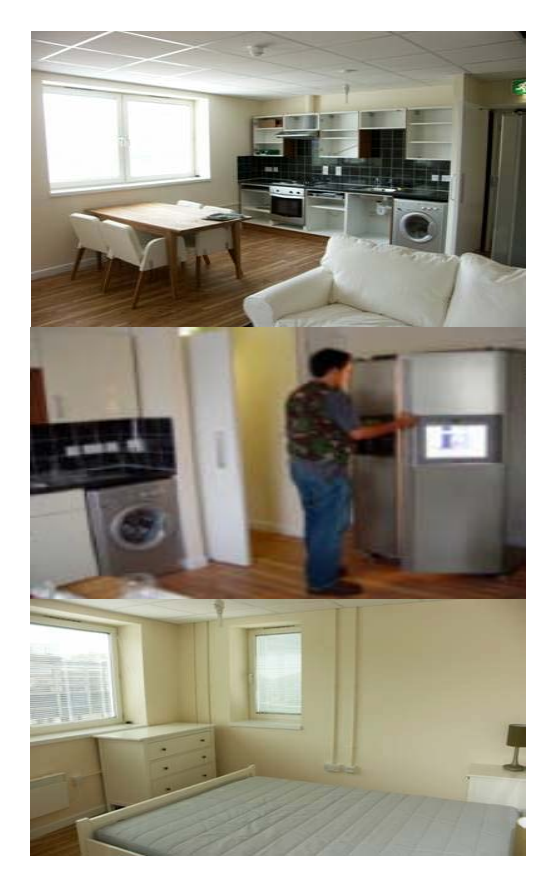
Fig. 2: Views of the iSpace

The iSpace is a purpose-built test-bed for pervasive computing research, the iSpace features all the furniture and devices found in a normal home environment, in addition to hollow walls and ceilings fitted with a myriad of embedded-computer based technology. [5][6][14]