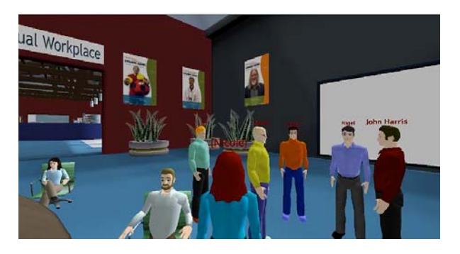
Fig. 5: Sun's MPK-20 Meeting Environment

Currently the avatars themselves cannot use objects and use only a basic form of artificial intelligence allowing them only to randomly wander around the environment, when not being controlled. The scene generated by wonderland and displayed in the client window can be viewed from first-person or several third-person perspectives.