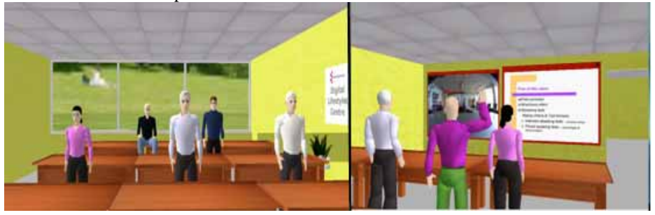
Fig..5 Lecturer view of remotely located students Fig.. 6 Student View of Lecture

The objective of the MiRTLE (Mixed Reality Teaching & Learning Environment) is to provide a mixed reality environment for a combination of local and remote students in a traditional instructive higher education setting. The environment will augment existing teaching practice with the ability to foster a sense of community amongst remote students, and between remote and co-located locations. The mixed reality environment links the physical and virtual worlds. Where students are distributed across geographically dispersed locations the hybrid learning environment allows an increase in teaching productivity by enabling teachers to deliver only one lecture to all students rather than duplicate lectures which incur time and travel costs