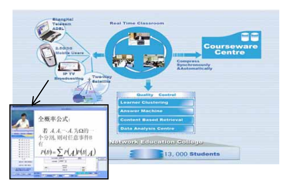
Fig. 3 – The SJTU eLearning System Architecture (inset - Option 1 display)

Currently, the Network Education College has about 17,000 Students; 99% of them are working professionals who attend the University part time. The large number of students in this College and its expansive course delivery systems make it a perfect place to test our mixed reality technology: MiRTLE.