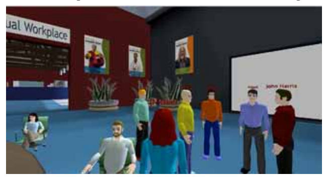
Fig.. 2: Sun's MPK20 Environment

objects using a graphics package such as Blender or Maya. Project Wonderland provides a rich set of objects for creating environments, such as building structures (such as walls) and furniture (such as desks) as well as supporting shared software applications, such as word processors, web browsers and document presentation tools