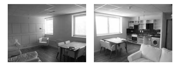
Fig. 1. The iDorm2 test bed