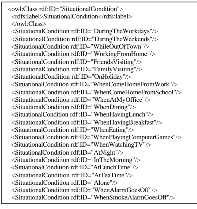
Figure 8 – Example of Context Condition

similar in idea to Vastenburg's "situated profile" where he uses situations as a framework for user profile so that the values of the profile are relative to situations [17].