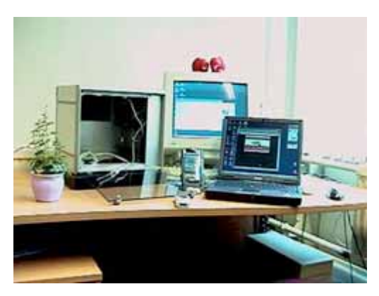
Figure 7. TESA experiment environment.

Figure 7 shows the experiment environment.