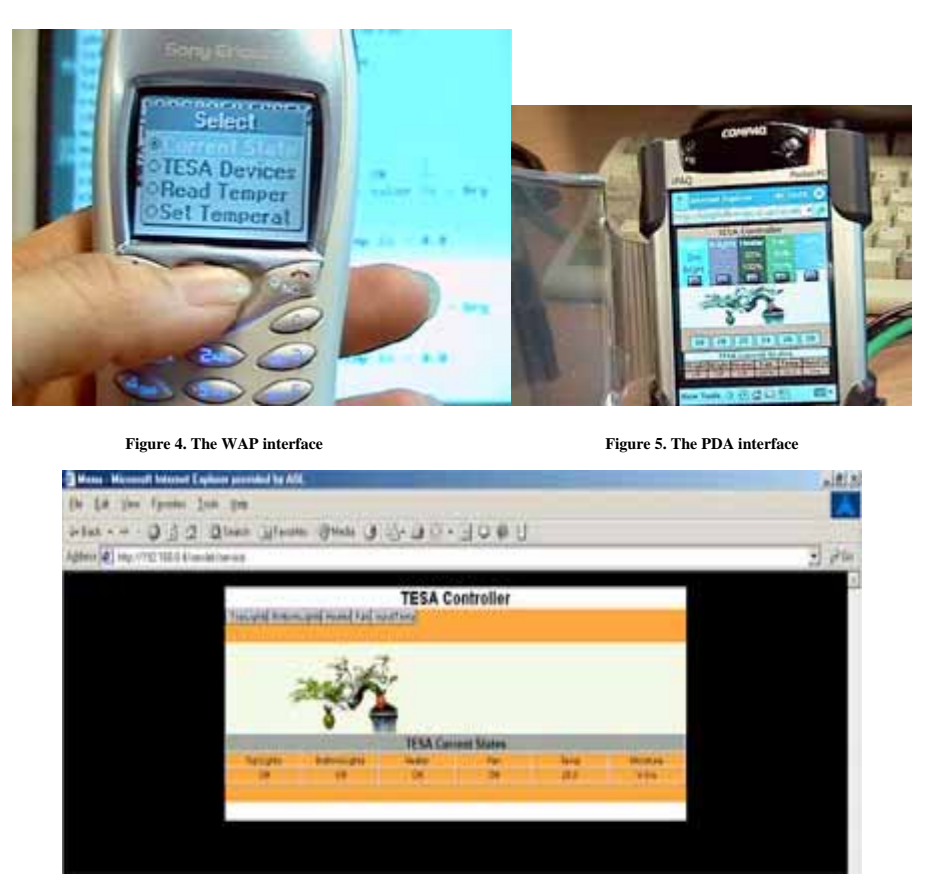
Figure 6. The PC WEB interface.

In proceedings of the IADIS International Conference, WWW/Internet 2003, Algarve, Portugal, 5-8 November 2003 (http://www.iadis.org/)