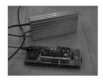
Figure 1 - University of Essex Prototype building services agent

For physical disappearance artefacts will need relatively small low-cost embedded computers (possibly based on application specific micro-electronic fabrication). For example typical specifications might be Cost: \pm 20-\pm 50 , Size: <2^2 cm, Speed: 1-10MHz, Memory: 1-2 MB, I/O: 10-50 I/O channels. Examples of two real devices are shown in figures 1 & 2.