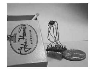
Figure 2 - University of Massachusetts Prototype Embedded-Internet Device