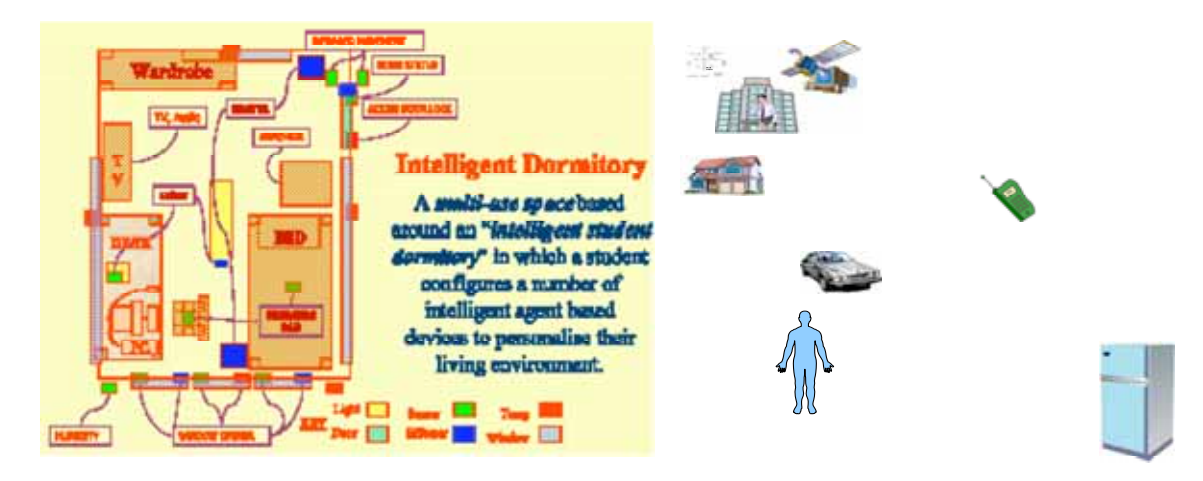
Figure 4 - Intelligent Inhabited Environment

occupant. Being a student dormitory it is a multi-use space (i.e. contains areas with differing activities such as sleeping, working, entertaining etc). The occupant of the room (a student) would be free to decorate his room with whatever artefacts he chooses (both computer and non-computer based; passive and active). Because this room is of an experimental nature we are fitting it with a liberal placement of sensors (e.g. temp. sensors, presence detectors, system monitors etc) and effectors (e.g. door actuators, equipment switches etc), which the occupant can also configure and use. Our expectations are that the occupant would chose to decorate his personal space (the room) with a variety of artefacts ranging from building service devices such as heaters to entertainment systems such as CD/TV. A possible scenario is as follows. The student moves into the dormitory, which contains some existing artefacts with him. He then runs a configuration program on his PC that allows him to set up associations between sensors and effectors.