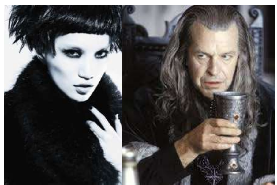
Photo 2. The Lord of the Rings Movie: coat design inspirations

method concern both the clothing design and the market socialisation aspects, giving them a competitive advantage in both.