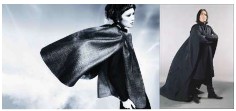
Photo 1. Harry Potter Movie: design inspired design by the film's capes

Sunfed Fashion is a Chinese SME with a marketing centre in Beijing and a R&D facility in Shanghai, affiliated to a USA parent, the Sunfed Group. It has established a branding reputation in the Chinese market for producing distinctive professional women's fashion-wear, being awarded the "Best of Ten" in ladies fashion for five consecutive years at the Dalian International Fashion Festival. Sunfed has exhibited a high growth over its operating period (almost 20 years) reporting annual sales of US$45 million in 2012. Despite this success, it remains small with only 270 employees.