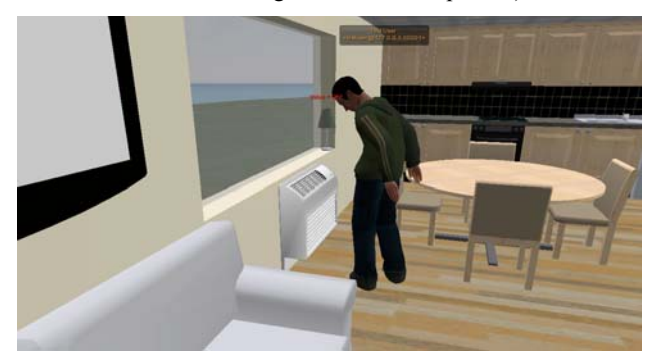
Figure 5. An avatar representing a heater controlling agent

by the avatar reading the temperature off a thermometer in the virtual world and recording the data on a clipboard).