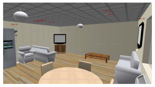
Figure 4. The Virtual iSpace Demonstration World

One of the key benefits of a virtual world is that it doesn't have to be limited by the constraints that naturally exist in a physical environment. This premise has recently been utilised in the demonstration of a virtual world that models our real iSpace [Fig. 4]. The mixed reality architecture was demonstrated to a group of potential end users in the iSpace, with the virtual components being displayed on large, wall-mounted, touch-screen displays.