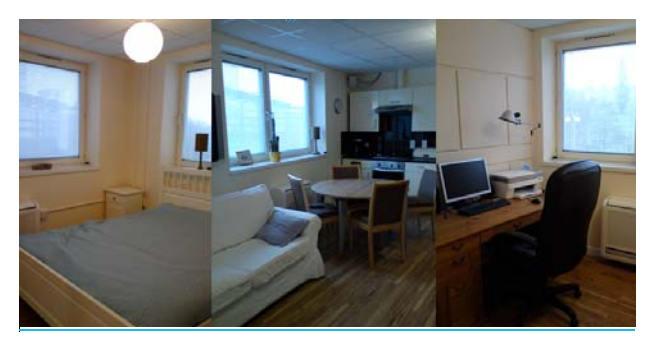
Figure 1. The iSpace.

For some time now, we have faced similar difficulties in effectively demonstrating our iDorm [5] and iSpace [6] [Fig. 1] based work to various audiences. Ranging from ad-hoc events that promote Science and Technology to the public, through high-ranking technologists from funding bodies and ambassadors from potential collaboration partners. More recently, in our group, a flurry of demonstrations to small groups of people (~10 in size) have prompted us, as active members of the Intelligent Inhabited Environments Group (and ubicomp community at large), to look more closely at the way in which we can make our research more readily accessible to people that have limited exposure to technology in general.