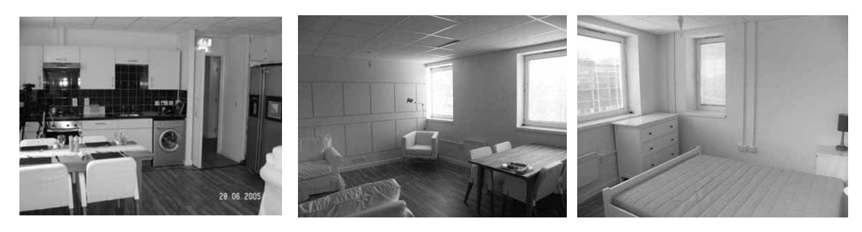
Figure 1 – The iDorm2

containing the usual rooms for activities such as sleep, work, eating, washing and entertaining. It comprises numerous networked appliances such as heating, lighting and entertainment systems. iDorm2 devices are networked using IP and Universal Plug & Play (UPnP). UPnP is a distributed middleware that employs event-based communication, supporting automatic discovery and configuration.