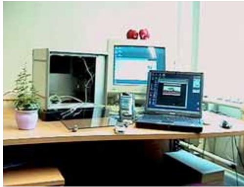
Figure 7. TESA experiment environment.

Figure 7 shows the experiment environment.