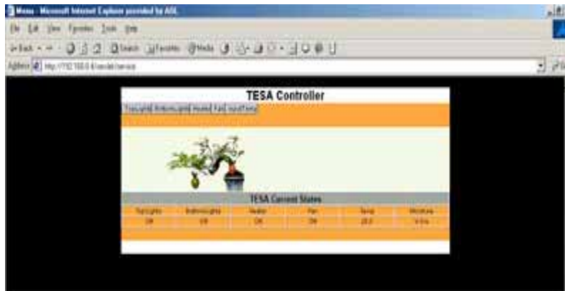
Figure 6. The PC WEB interface.