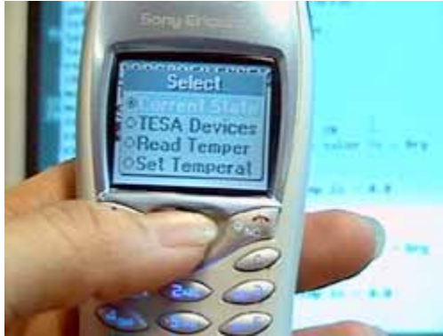
Figure 4. The WAP interface