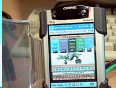
Figure 5. The PDA interface